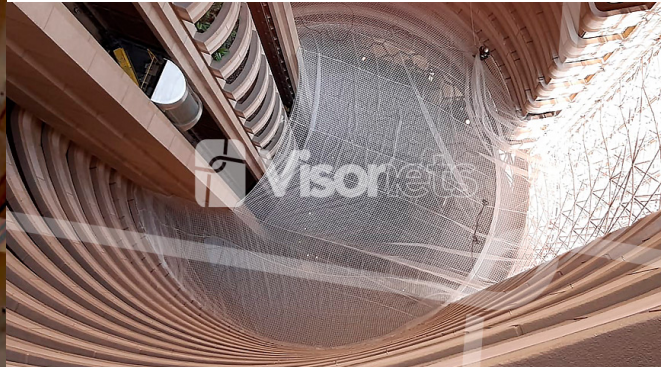
Safety net Type S - Special shape

Let's see one of the latest special Project: A customer came to us asking if is posible to make a safety net with a very speacial shape, because they have to install it for protecting the fall people and debris in manteniencia labours inside a big rated hotel. The solution with netting had to protect the worker and the hotel clients because the net will have to be just up in the lobby.